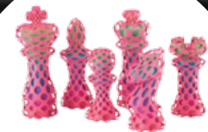
Consumer goods Artwork / collectibles / jewelry