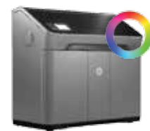
JET FUSION 380 3D 7.5 x 10 x 9.8 in Build Volume