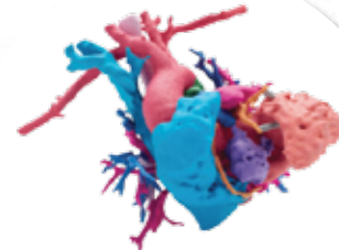
Healthcare anatomic models