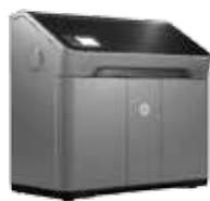
JET FUSION 340 3D 7.5 x 10 x 9.8 in Build Volume