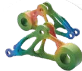
Color presentation models