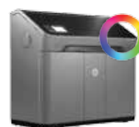
JET FUSION 580 3D 7.5 x 13.1 x 9.8 in Build Volume