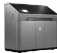
JET FUSION 540 3D 7.5 x 13.1 x 9.8 in Build Volume